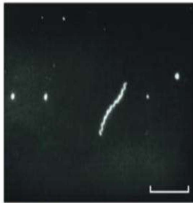
(B) Dark Field Unstained cells are seen against a dark background.